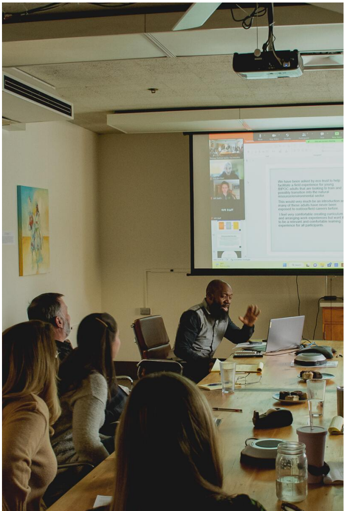
Legislative Policy Framework