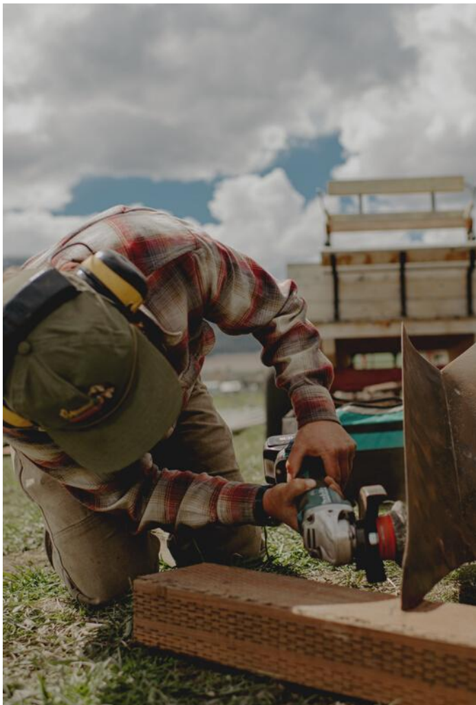
Access to Capital