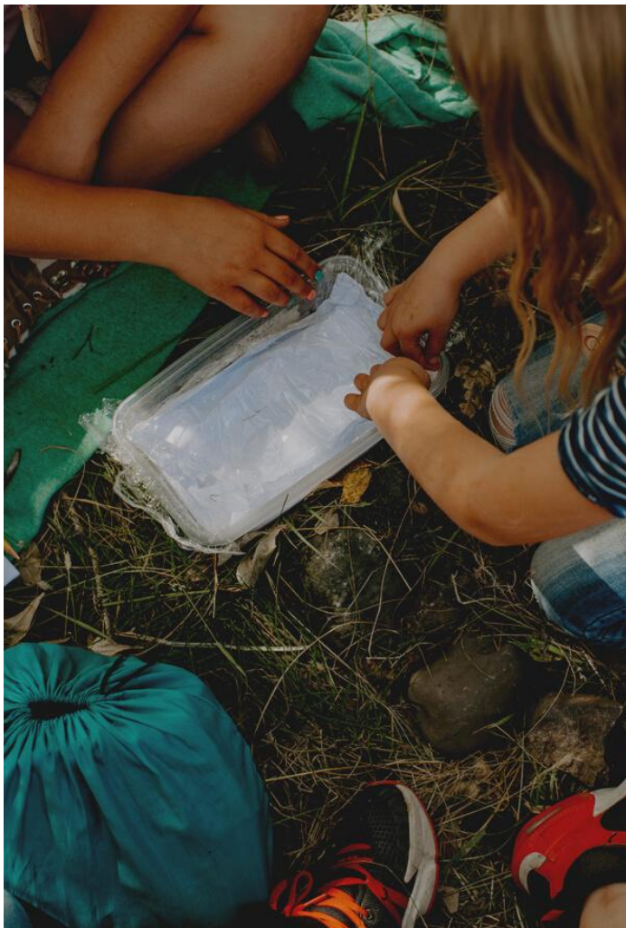
Education, Training, R&D