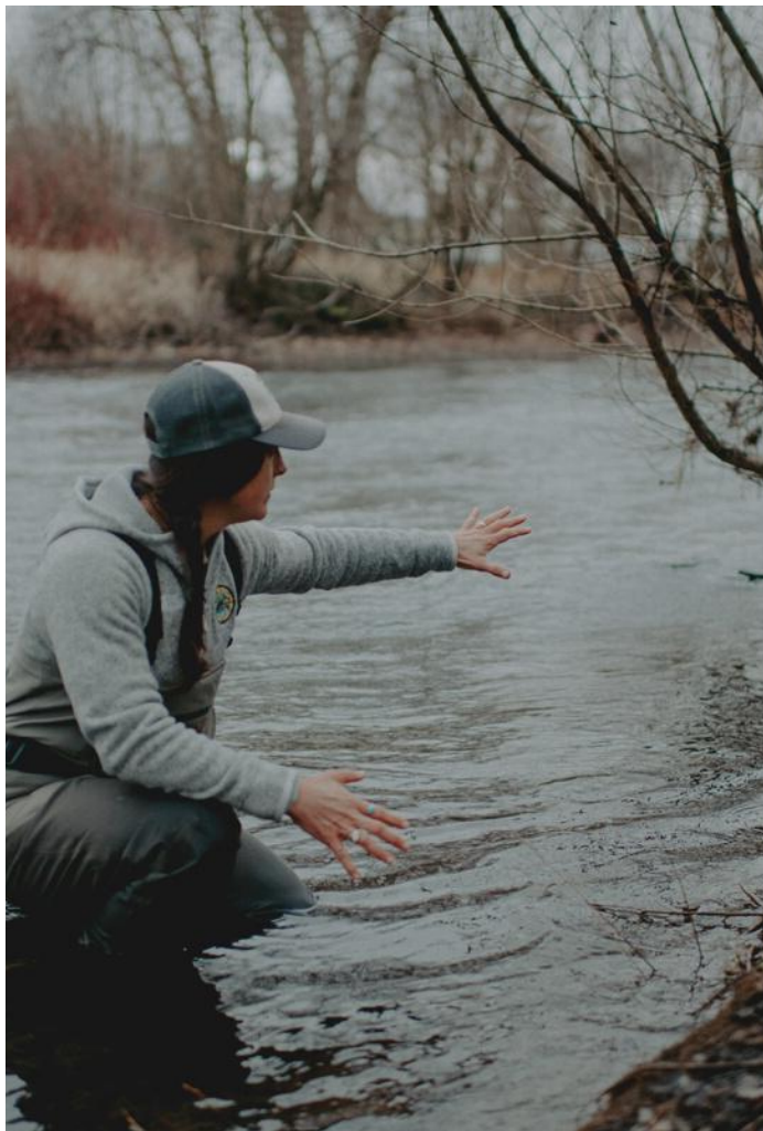
Land & Water Stewardship