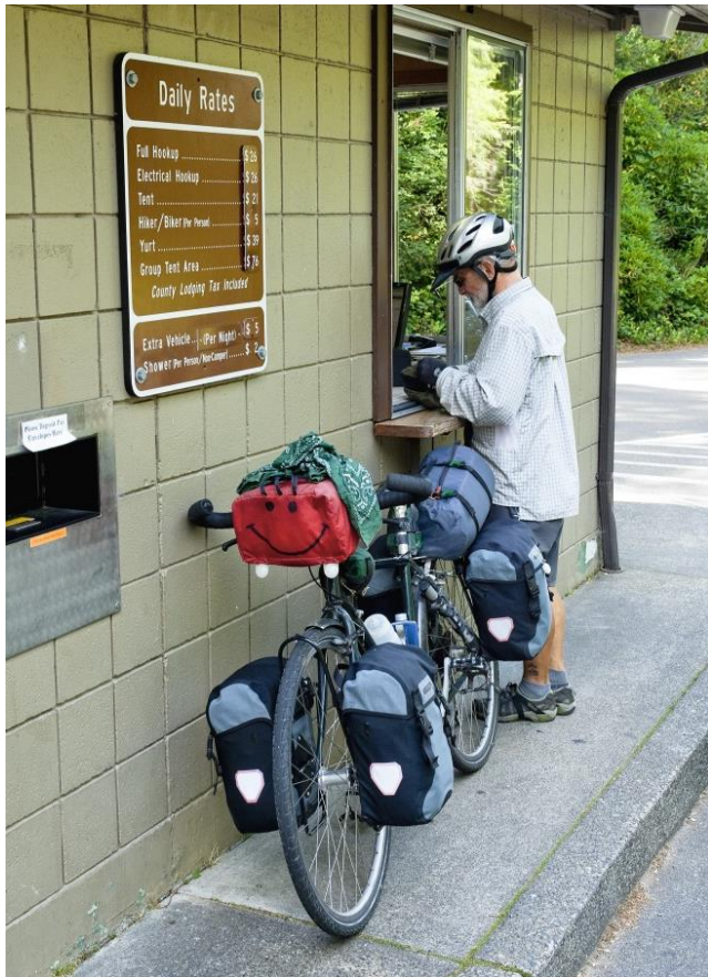
Campers arriving by bicycle pay a $5 fee to use hiker/biker sites at Oregon State Parks.

Bicycle camping requires minimal space and resources. Self-contained bicycle travelers who carry their own gear need at minimum a space for their tent and a place to park their bike. See page 7 for bicycle camping amenities that are low cost, low risk, and improve bicycle traveler's camping experiences immensely.