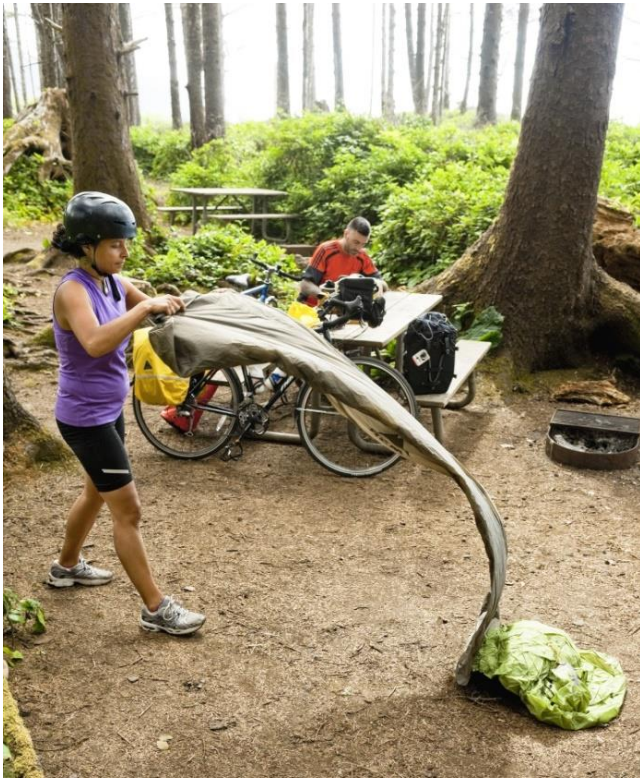
Cyclists camp at Cape Lookout State Park in Oregon.

Offering bicycle camping not only shows bicycle travelers that they're welcome, it encourages healthy, sustainable and fun discovery of the outdoors while increasing visitation and economic impacts.