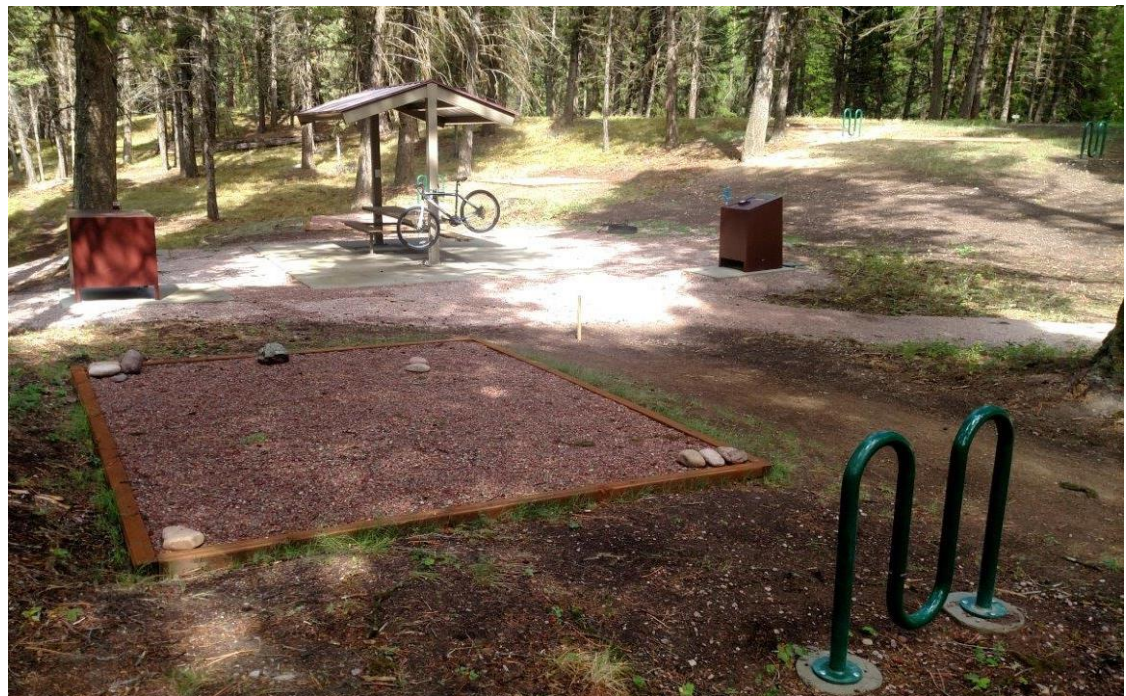
A new hiker/biker site at Salmon Lake State Park in Montana.

Each hiker/biker site included bike racks, bear-proof lockers, a bike repair clamp, electrical outlets, and a covered picnic area. They cost $37,000 - $53,000 depending on the site conditions and the extent of work involved. Additionally, instead of charging the usual $18-$28 for tent camping, there is now a specific hiker/biker campsite fee of $6 for residents and $12 for visitors.