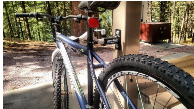
Cyclists set up camp at Beverly Beach State Park in Oregon (left). A bike clamp offers easier bike maintenance at Montana State Parks.